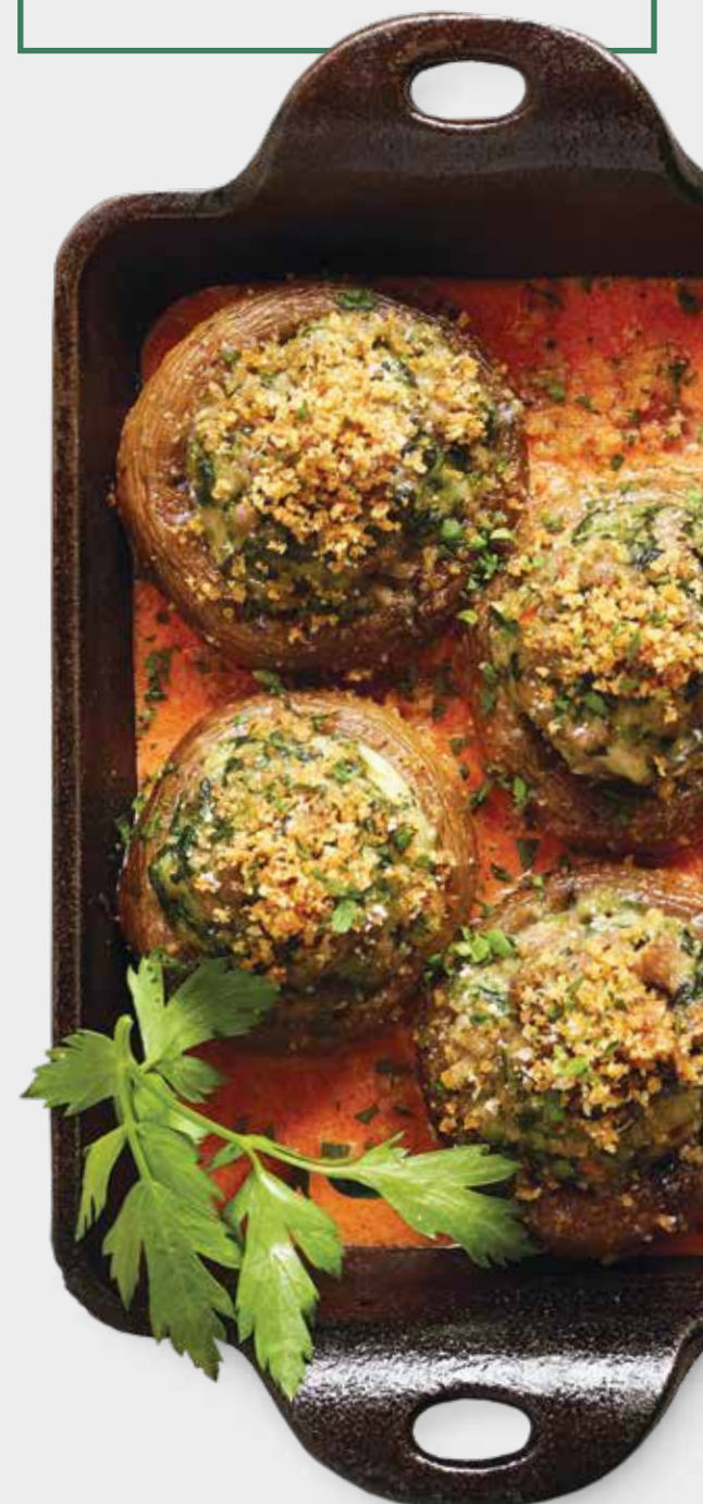
THREE-CHEESE & SAUSAGE STUFFED MUSHROOMS

Stuffed with sausage, spinach, ricotta, romano, mozzarella and Italian breadcrumbs served over our tomato cream sauce (290 calories) | 6.99